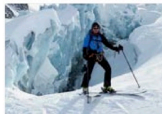
➤ Skiing through crevasses