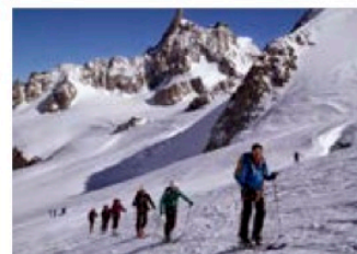
➤ Ski touring towards Col d'Entreves