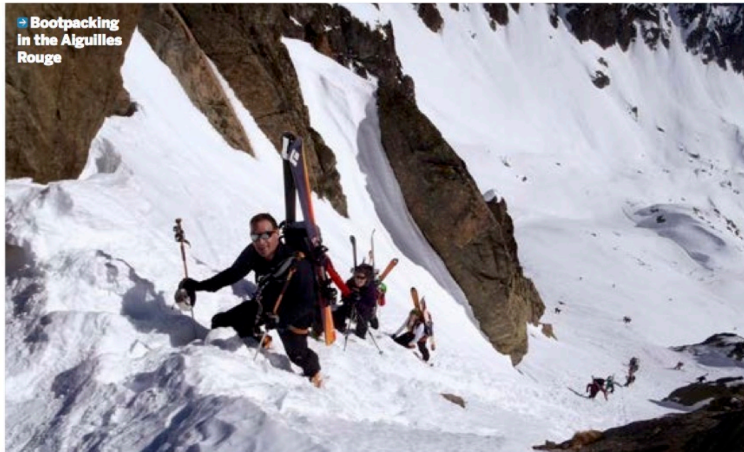
➤ Bootpacking in the Alguilles Rouges

➤ keepsers know something you don't. They are a hard working bunch, but they innately respect the mountains, and accept that they are dictated to by the snow conditions not commerce.